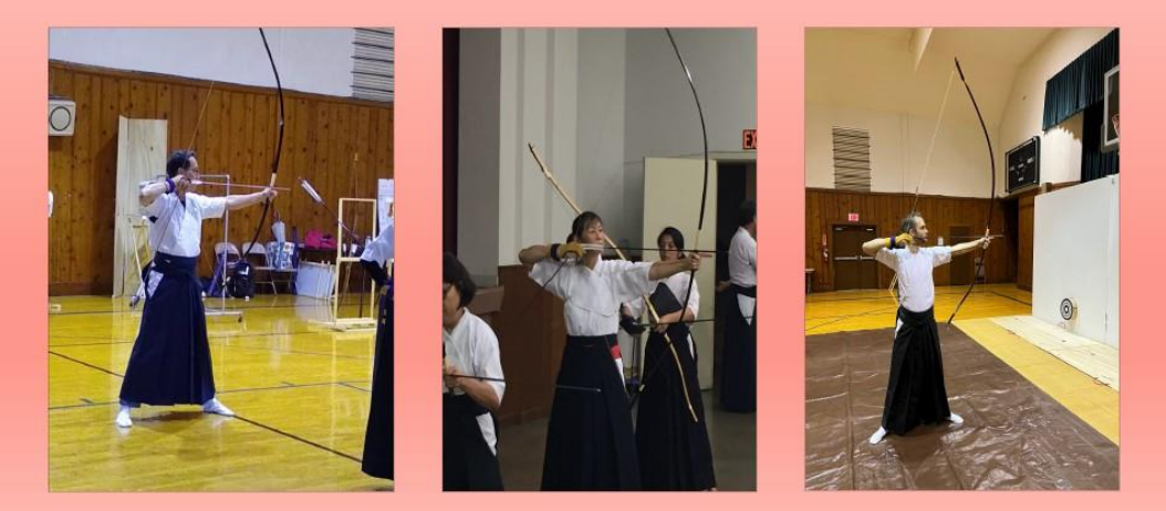
Kyudo Kai of Florin, Inc. is a fully insured, non-profit 501c3.